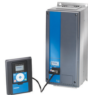
Keypad door mounting kit