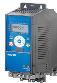
Option board mounting kit