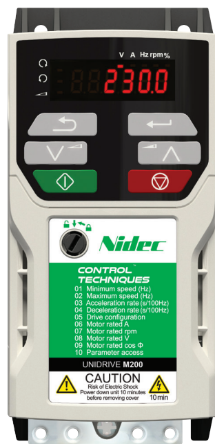
Unidrive M200 Frame Size 1