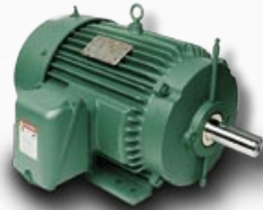
Integrated Toshiba Motor/Drive Packages

As a world leader in motor and drive manufacturing, Toshiba has a unique perspective into why and how motors perform and react to the ever-changing conditions encountered in modern manufacturing. Toshiba has married the extensive knowledge gained from being an integrated manufacturer of both motors and drives. With a true knowledge of how these products interact, Toshiba has developed the most powerful variable frequency drive available. G7 Series drives, along with a variety of other Toshiba drives and motors, are manufactured at our ISO 9001 manufacturing facility in Houston, Texas.