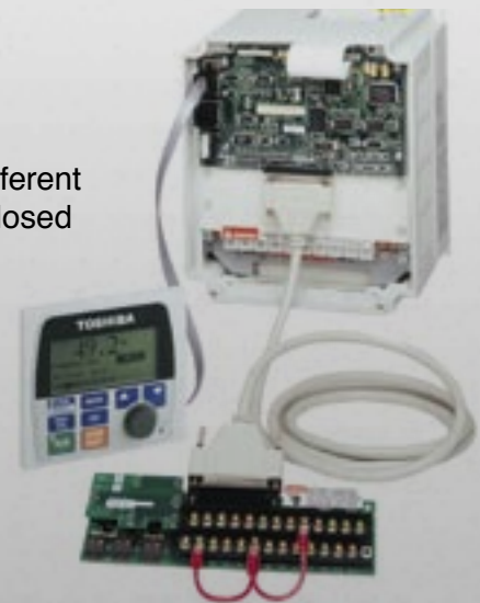
Remote-Mount Interface and Terminal Strip

The removable control terminal strip is available in dry contact, TTL or 120 VAC configurations and may be optionally DIN Rail mounted. The operator interface can be easily mounted remotely and configured for NEMA4/NEMA12 environments.