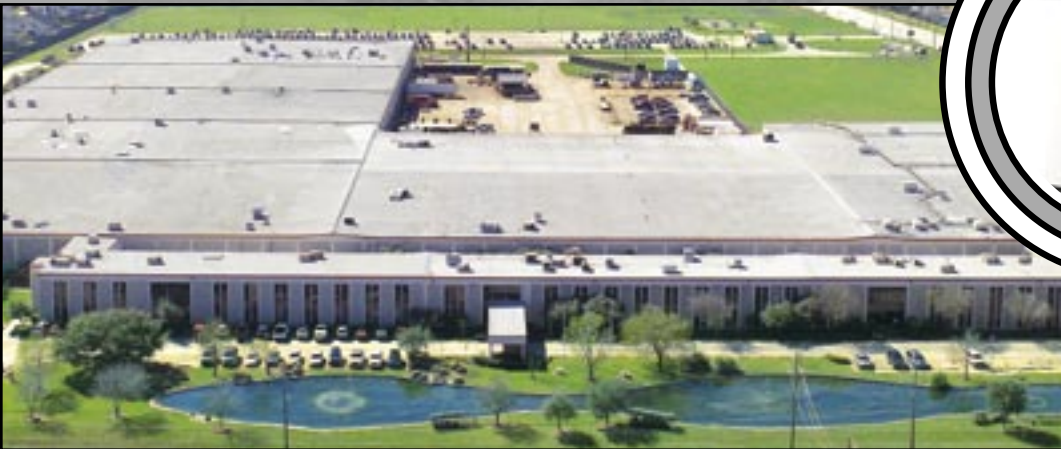
North America Headquarters & Manufacturing Facilities (Houston, TX)