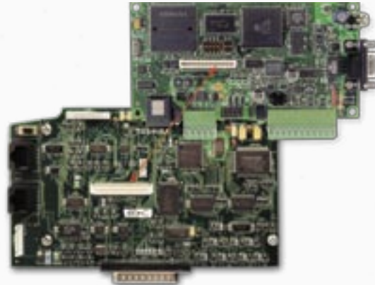
(left) G7 Control Board with Internal Stackable Communication Card

The G7 is designed to provide easy access to the DC bus. This allows for the implementation of common DC bus designs, access to the DC link and access to the dynamic braking IGBT, which is standard on the G7 drive. The Toshiba design solves your system and power quality issues.