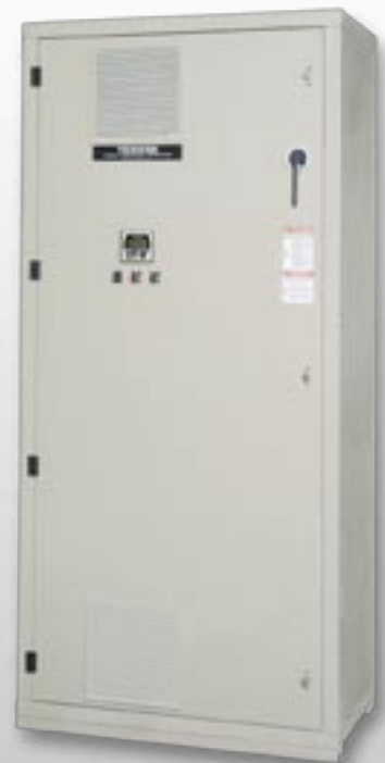
G7 Assembly Unit

Internal logic and cooling fan power comes from the DC bus which eliminates the need for control transformers, improves drive efficiencies and allows for extended ride-through capabilities.