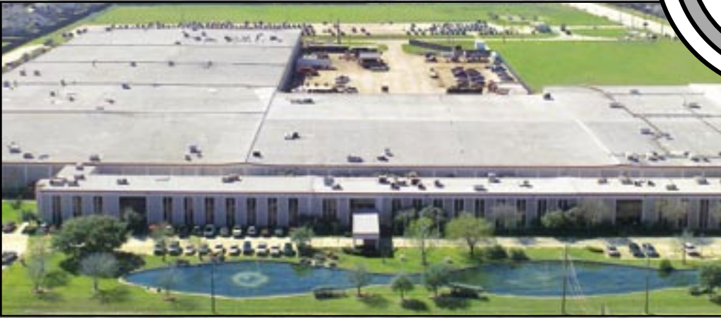
North America Headquarters & Manufacturing Facilities (Houston, TX)