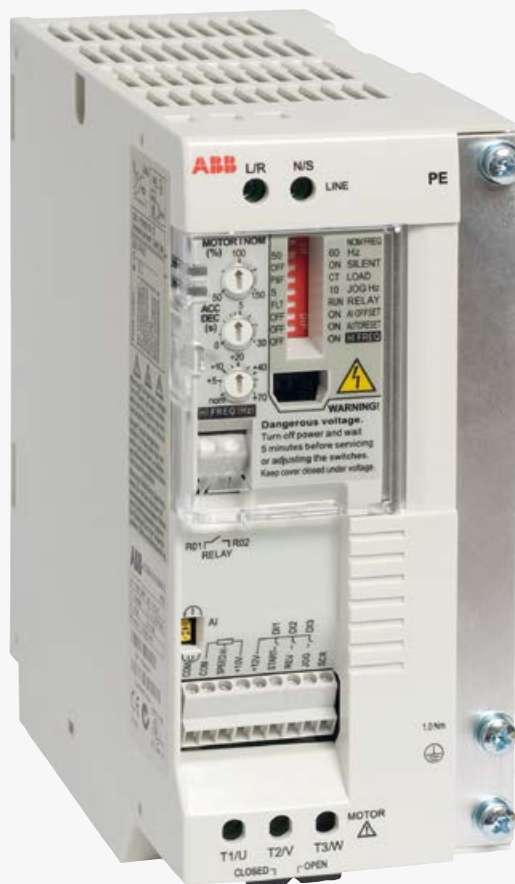
ABB micro drives ACS55, 0.18 to 2.2 kW